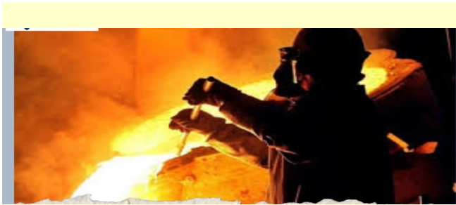
The lives and livelihoods of industrial workers are forgotten in war

Previously, about 90% of Iranian workers were employed under temporary or blank contracts with minimum wages insufficient for even one week's living costs. Now, with escalating